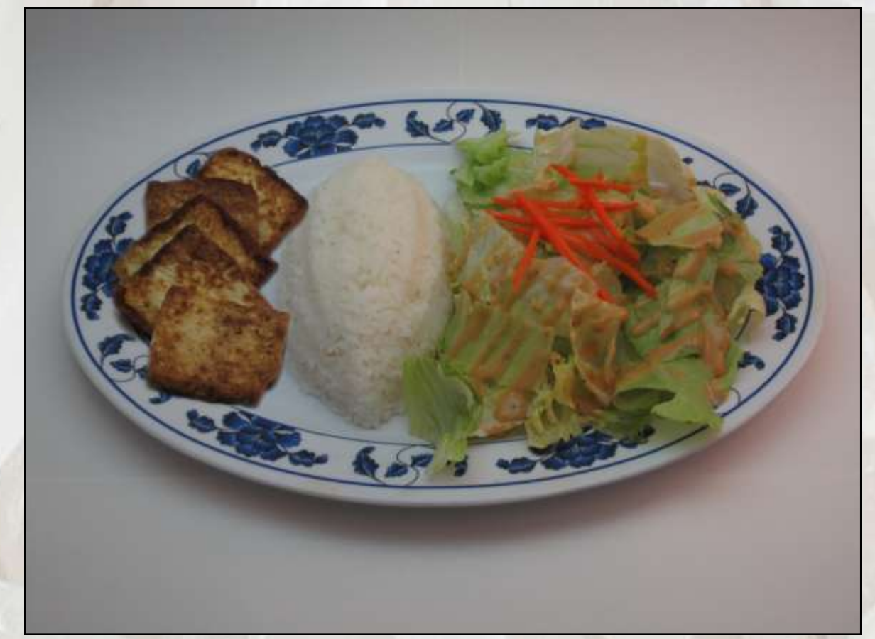
#12 Tofu Teriyaki $7.29