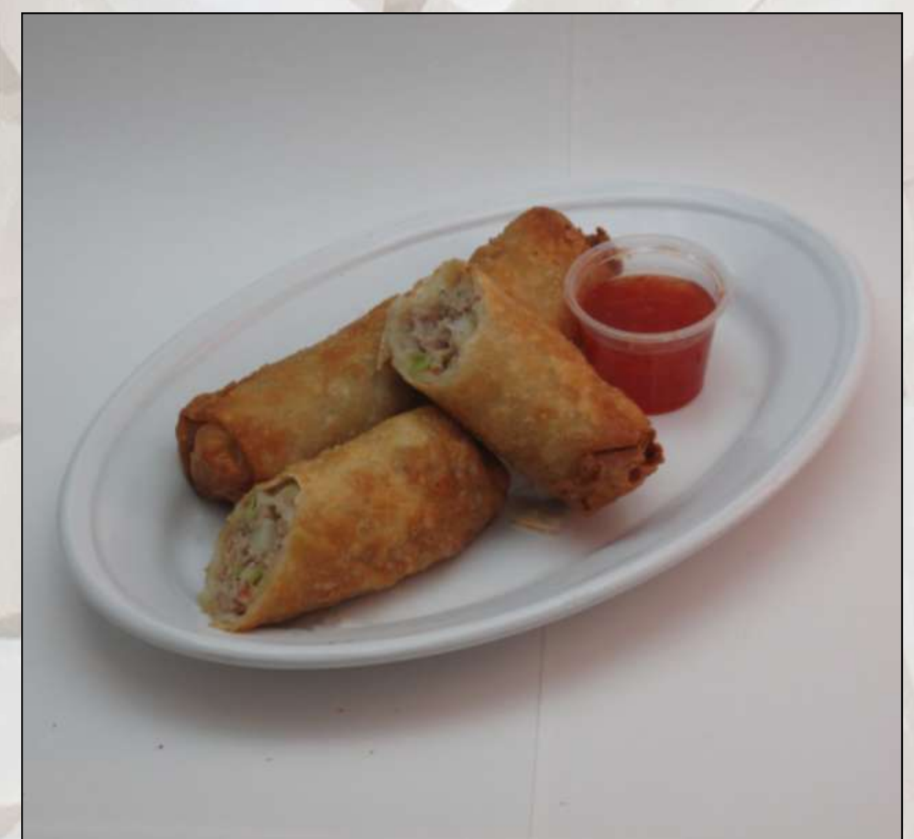
Egg Roll (2) $4.00