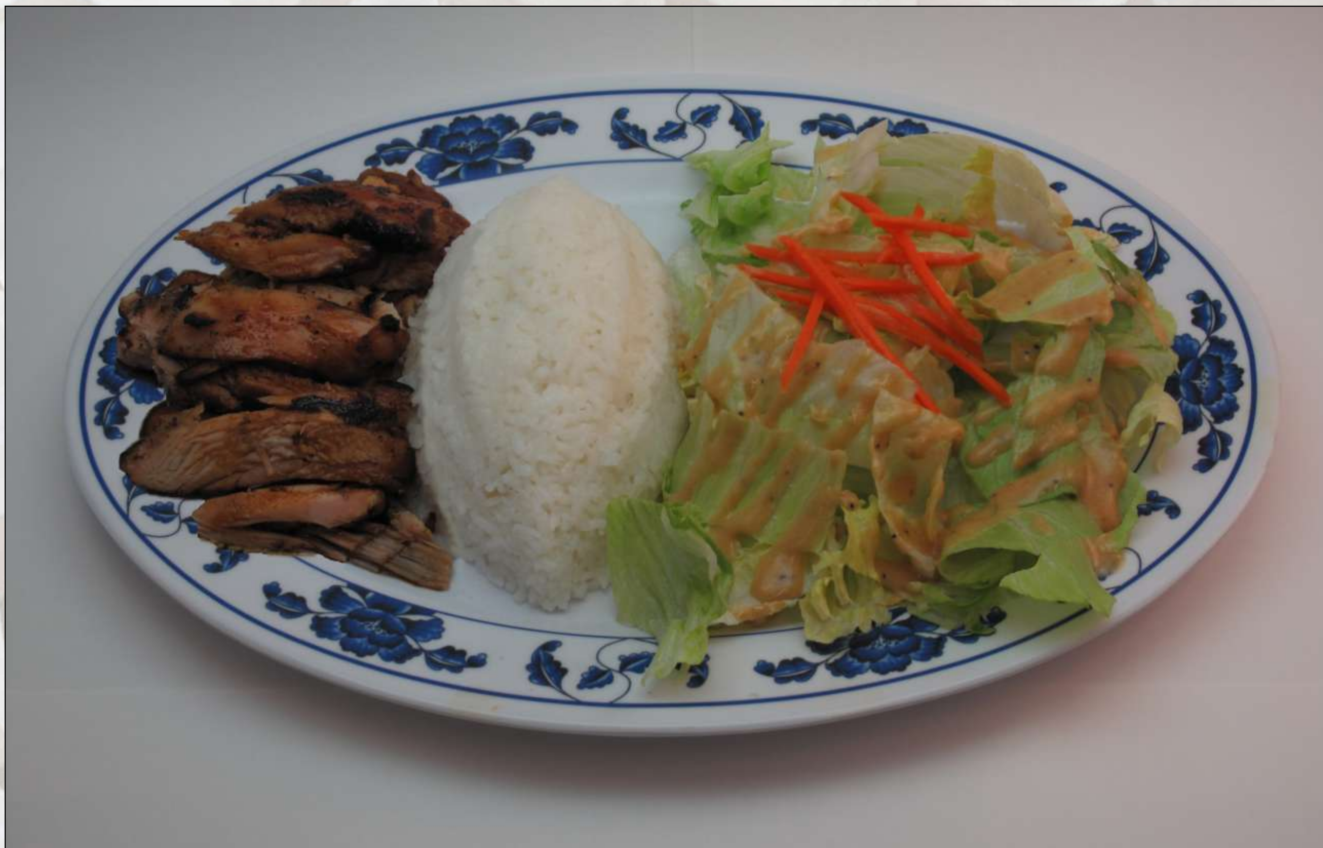
#2 Chicken Platter