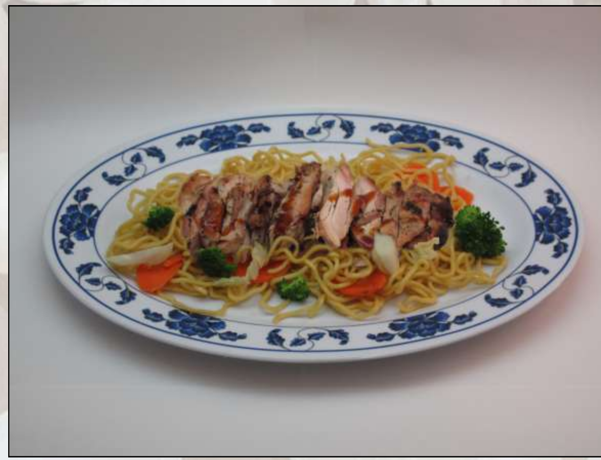
#8 Yakisoba Chicken $9.29