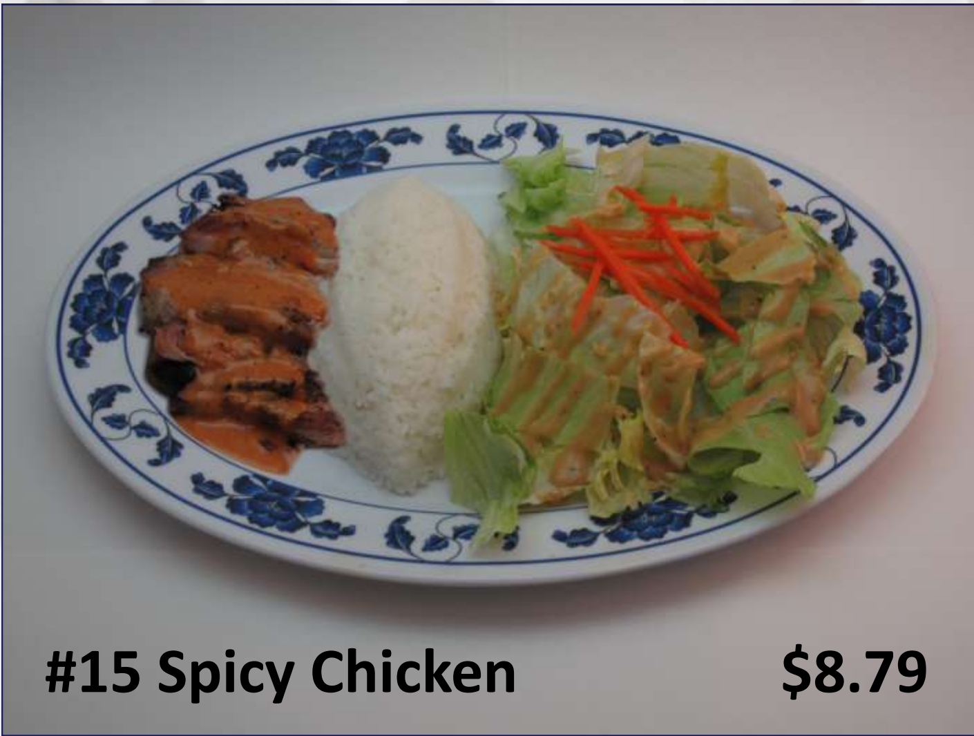
#15 Spicy Chicken $8.79