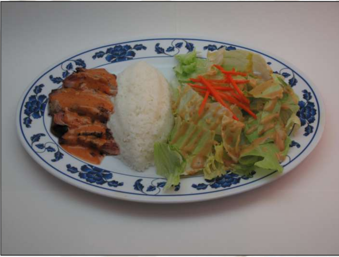
#15 Spicy Chicken $8.99