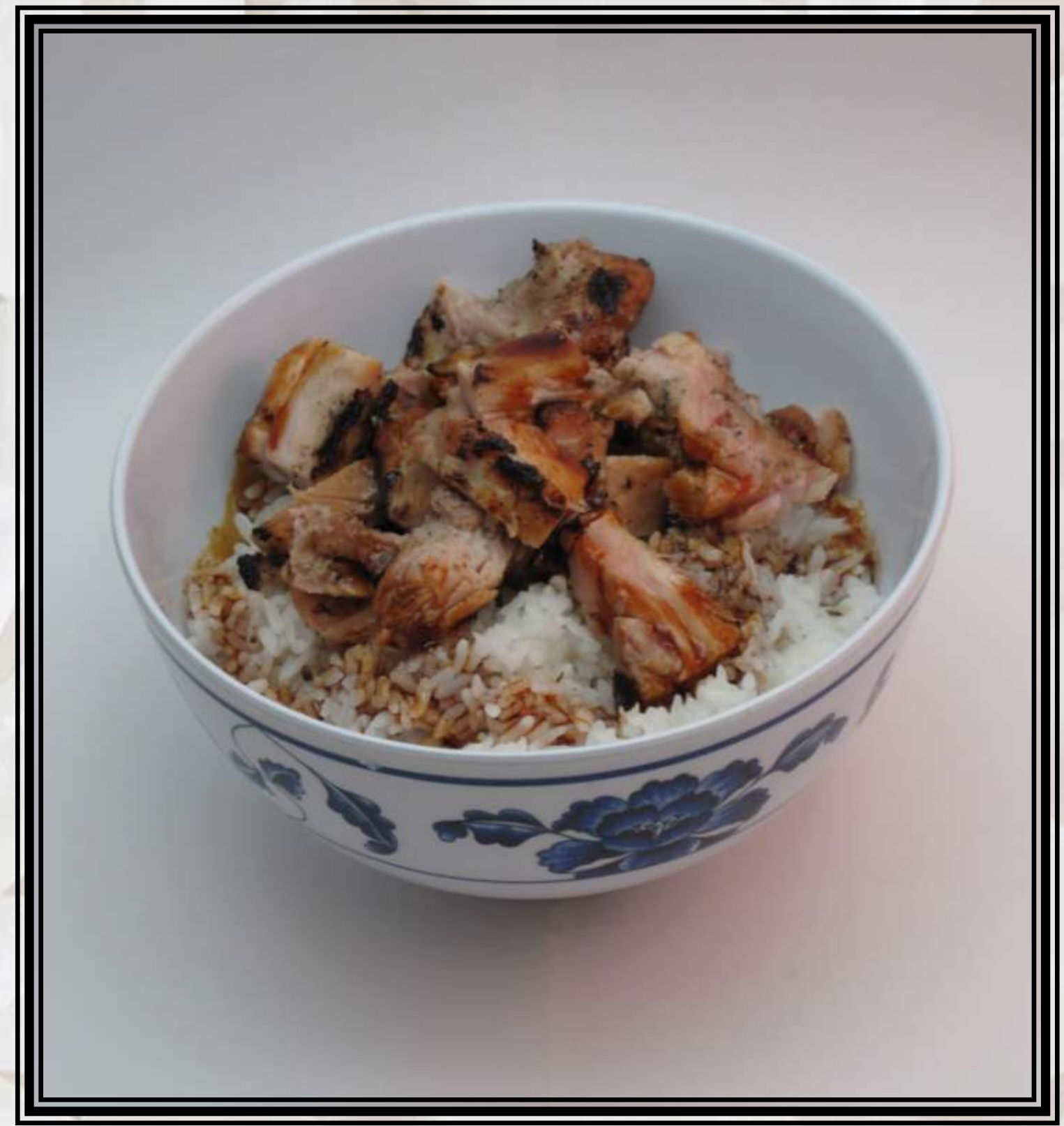
#1 Chicken Bowl $6.29