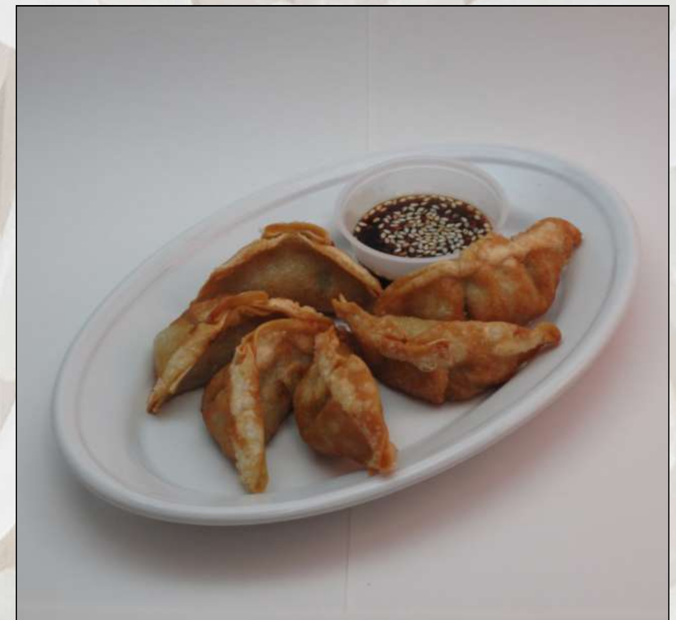
Gyoza (6) $4.75