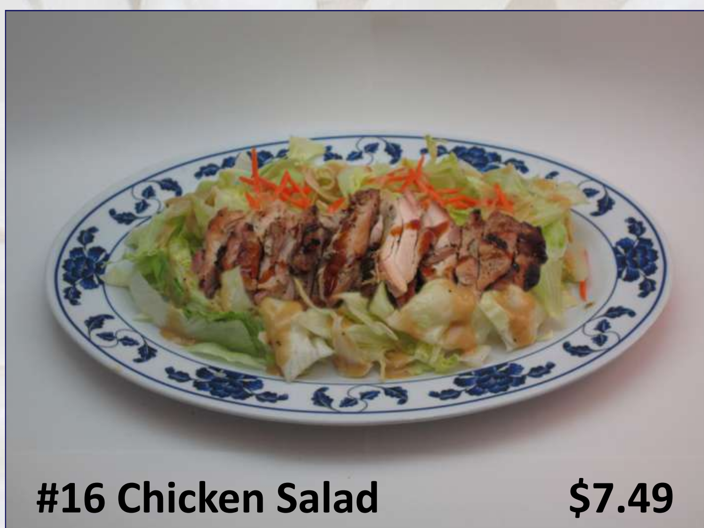
#16 Chicken Salad $7.49

Here at KB Teriyaki Grill we prepare our fresh never frozen chicken daily. First the chicken gets marinated with fresh onions, garlic, ginger, and soy sauce. Then we bake the chicken to ensure a consistent quality and flavor. Finally, the chicken makes its way to the grill where it's seared on both sides for that delicious char broiled taste. Topped with our signature Teriyaki Sauce it's a meal you're sure to enjoy.