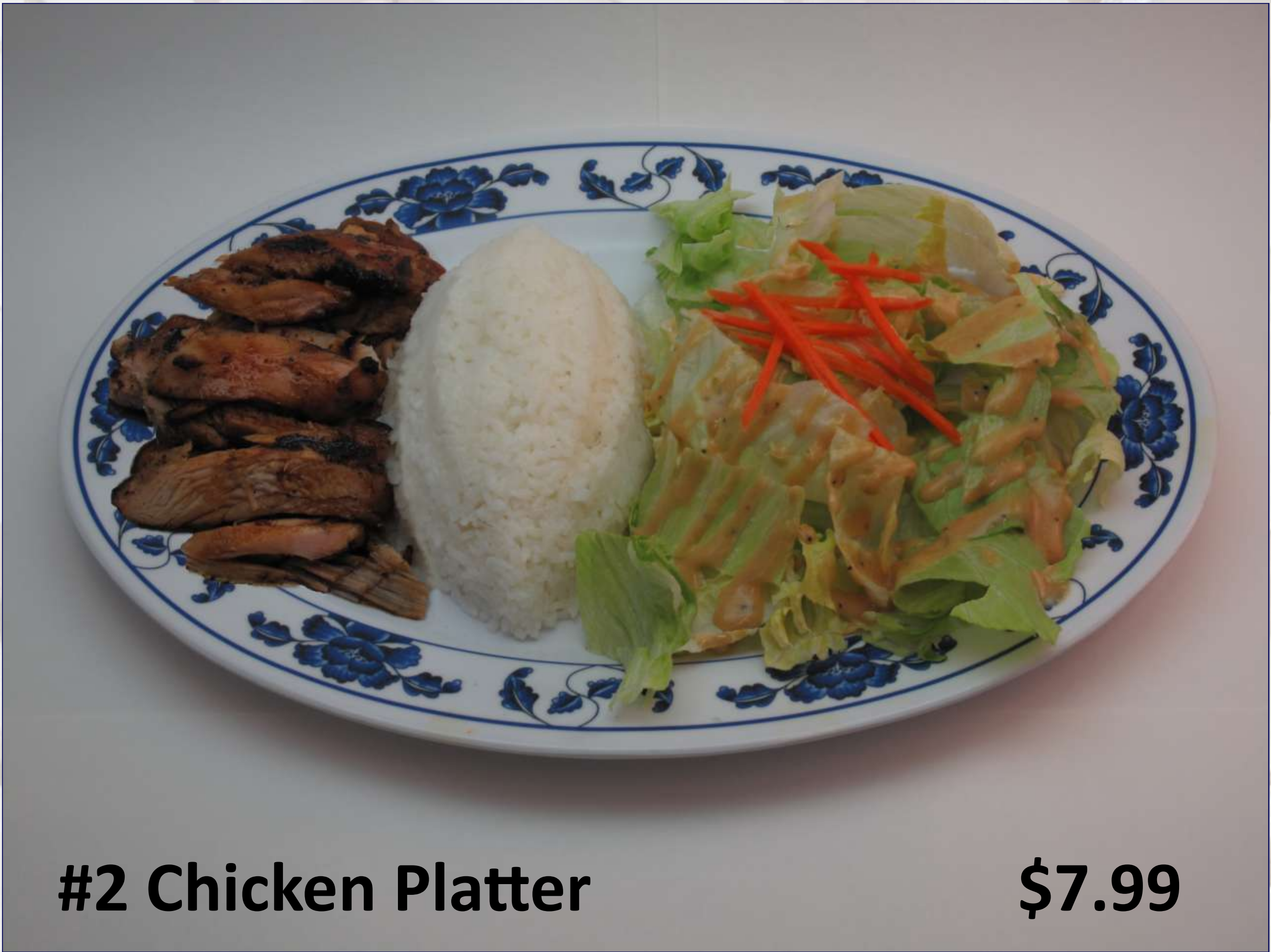
#2 Chicken Platter