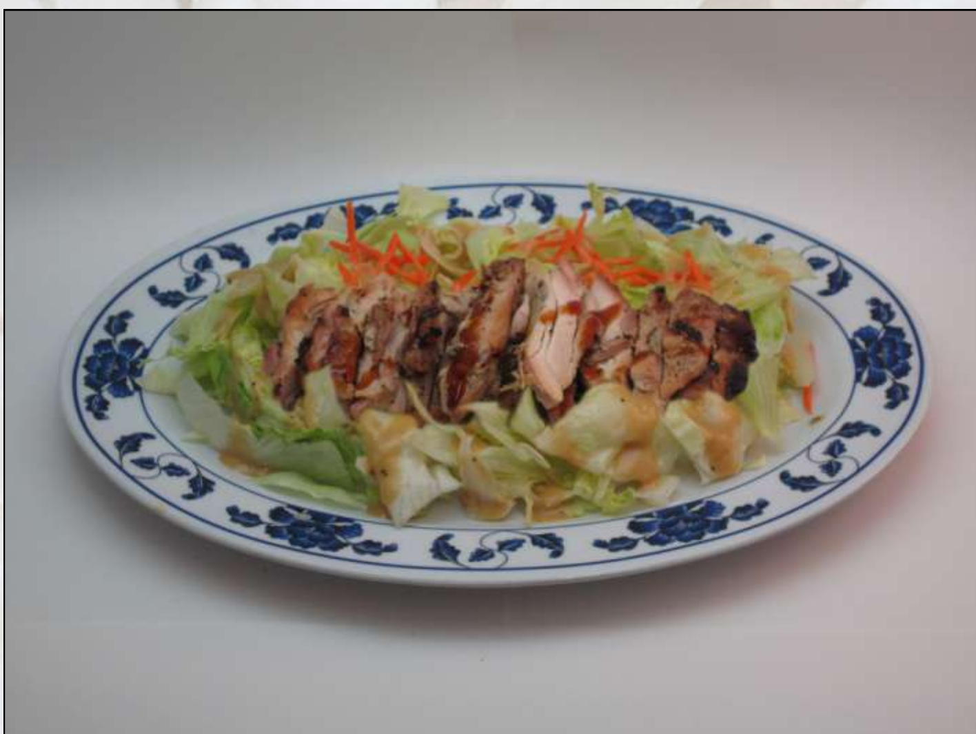
#16 Chicken Salad $7.79

Here at KB Teriyaki Grill we prepare our fresh never frozen chicken daily. First the chicken gets marinated with fresh onions, garlic, ginger, and soy sauce. Then we bake the chicken to ensure a consistent quality and flavor. Finally, the chicken makes its way to the grill where it's seared on both sides for that delicious char broiled taste. Topped with our signature Teriyaki Sauce it's a meal you're sure to enjoy.