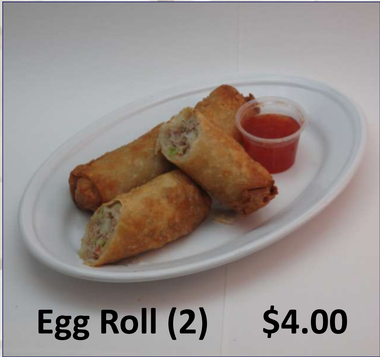
Egg Roll (2)