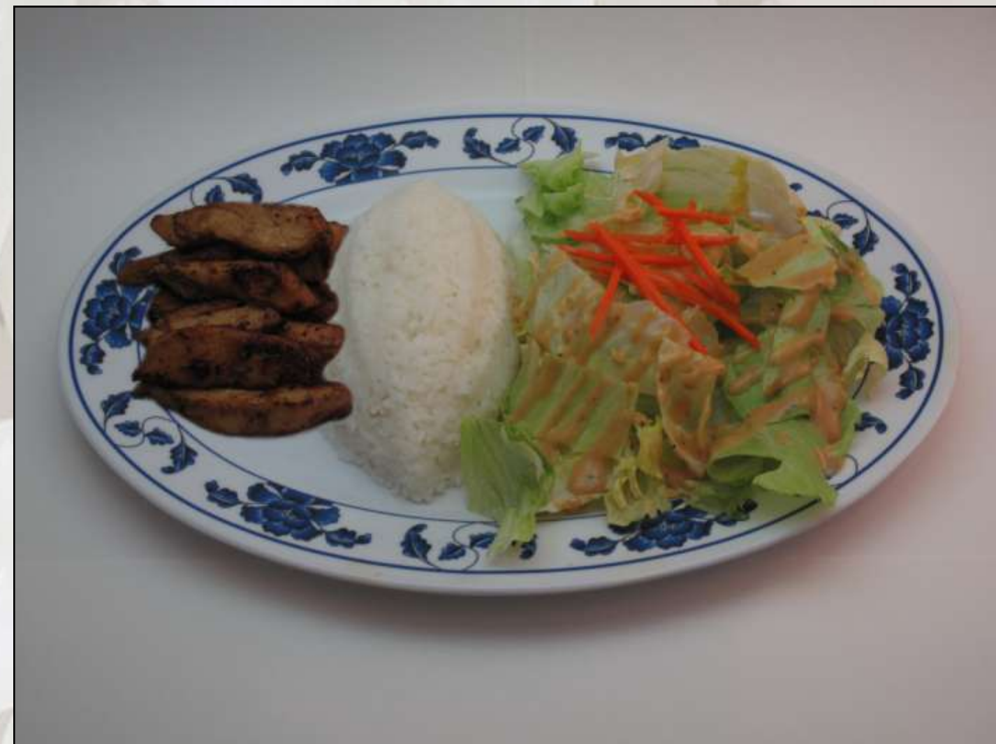
#13 White Meat Chicken $9.29