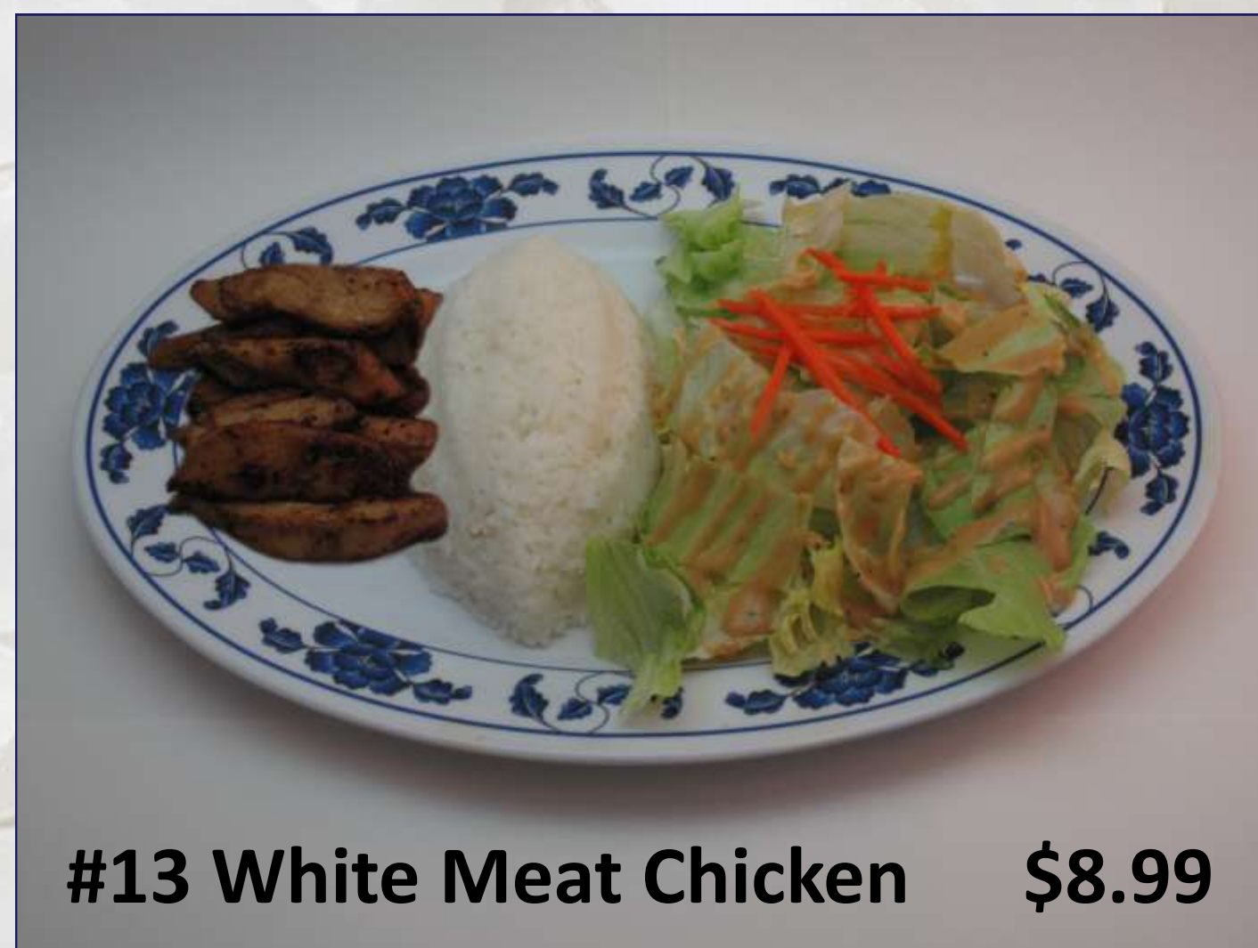
#13 White Meat Chicken $8.99